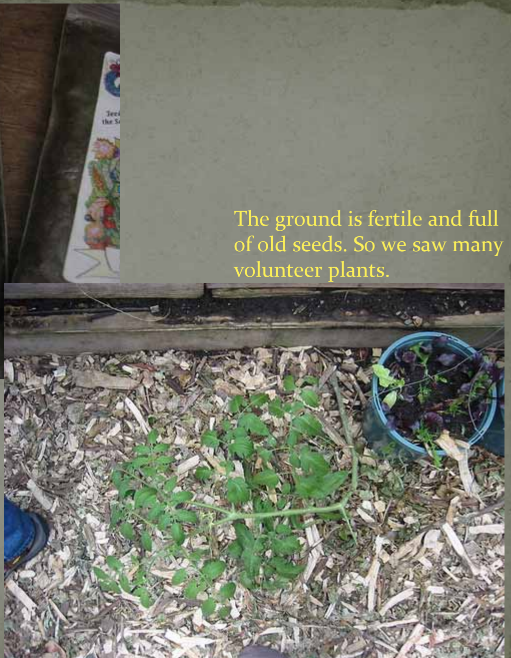
The ground is fertile and full of old seeds. So we saw many volunteer plants.